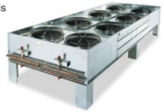
Remote Air-cooled condenser

TTI Series central chillers are offered with Air-Cooled or Water-Cooled condensers. The selection is influenced by the industrial environment where the TTI Series will be installed including available condensing water supply and plant ambient temperatures. The condenser is a heat exchanger where the heat absorbed by the refrigerant during the evaporating process is given off to the condensing medium. As heat is given off by the high temperature, high pressure refrigerant vapor, its temperature falls and the vapor condenses to a liquid.