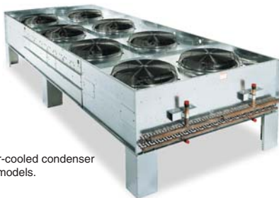
Typical remote air-cooled condenser for use on TTI-A models.