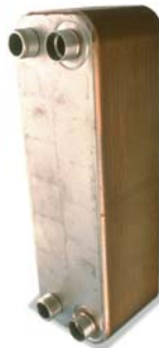
Brazed plate evaporator

Brazed plate evaporators are made of stainless steel plates brazed together with copper brazing material. This design promotes turbulent flow and high heat transfer rates in a compact, non-ferrous package. A cleanable basket strainer filter is included to protect the brazed plate evaporator from water born contamination.