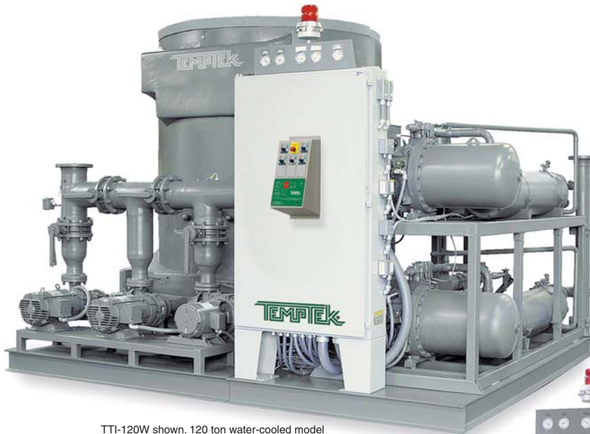
TTI-120W shown. 120 ton water-cooled model with optional standby pump and manifold.

David W. Ennes Blackhawk Machinery & Systems, Inc. 847.427.0414 ennes@chillerconnect.com