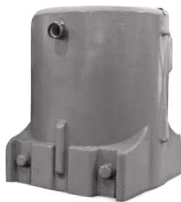
Polyethylene reservoir with insulation

The standard patented reservoir is a one-piece seamless design, rotationally molded from linear low density polyethylene and insulated with 3/8" dense foam insulation. The rectangular base accepts straight-line pump connections. The cylindrical shape adds structural strength. A tank baffle provides true 'hot-cold' operation. The standard service cover has cut-outs for distribution piping and an inspection opening. The tank volume is adequate to support expansion to 2 times its original chiller capacity (adding APT or WPT chilling module and additional pumps).