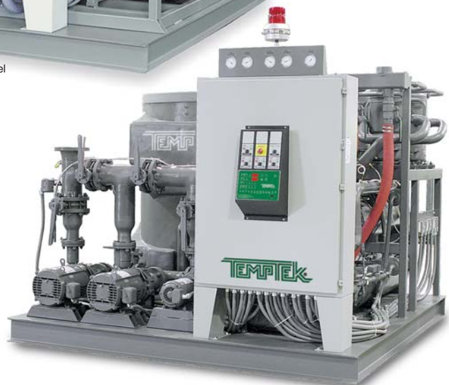
TTI-60W shown. 60 ton water-cooled model with optional standby pump and manifold.

PRICE & PERFORMANCE... for the LONG TERM