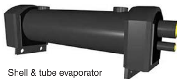
Shell & tube evaporator

Shell & tube evaporators are used on larger capacity systems. Refrigerant is circulated through copper tubes within the carbon steel shell to cool the process fluid that surrounds the tubes. Shell & tube evaporators are fully insulated and provide flexible, efficient heat transfer.